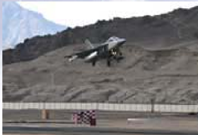
LCA makes history, passes cold tests at Leh - Details under technology